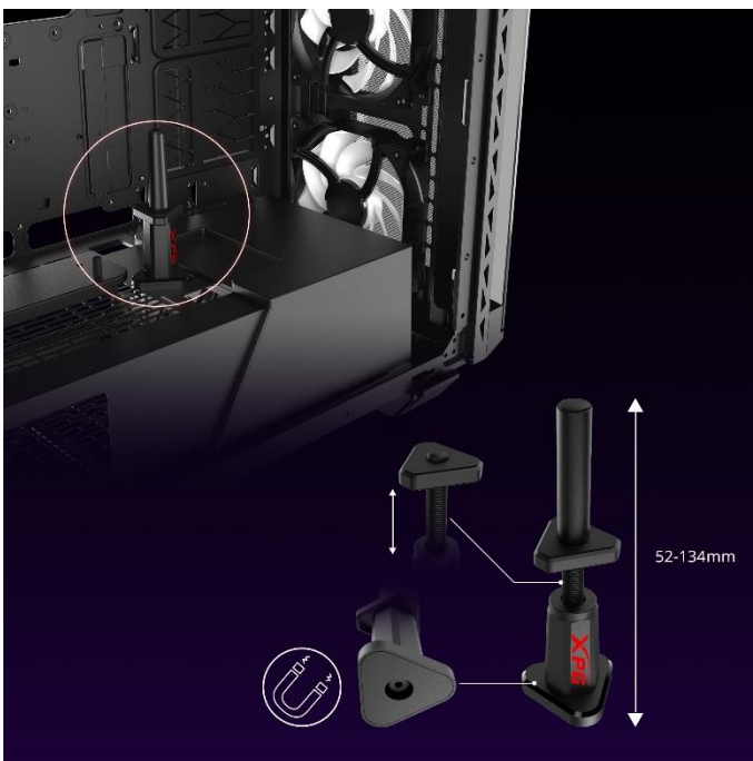
Strong, Adaptable Graphics Card Holder