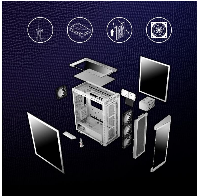
Easy Building, Easy Cleaning