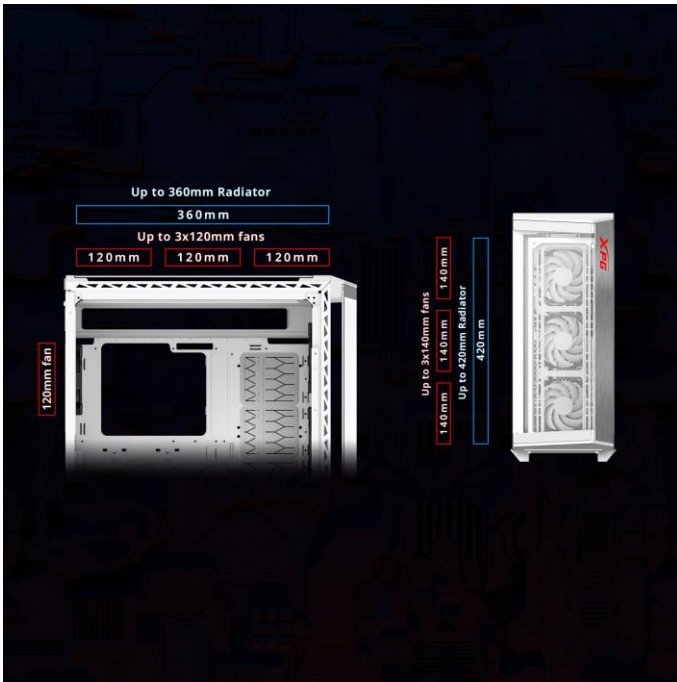
Enhanced Compatibility for Advanced Cooling Solutions