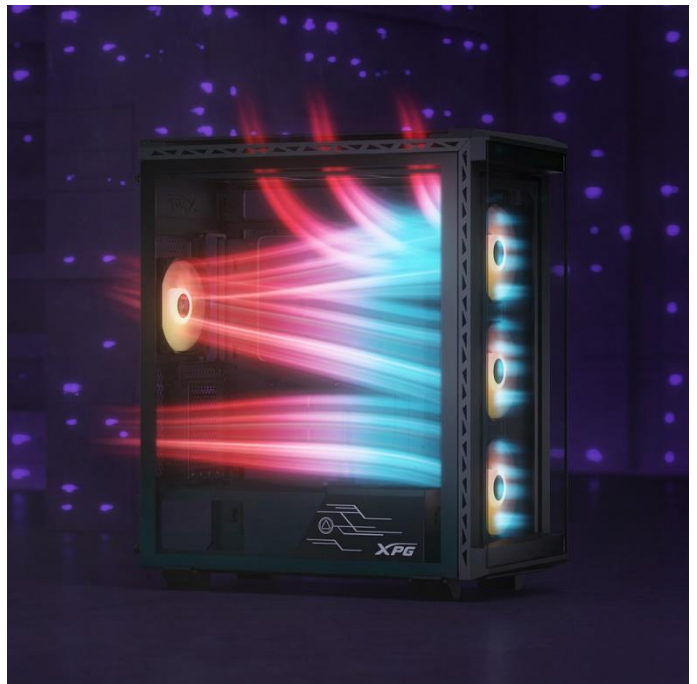
Optimized Airflow and Xtreme Cooling Efficiency