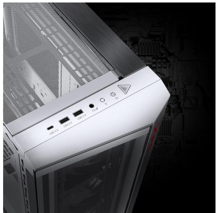
Efficient I/O Panel Design