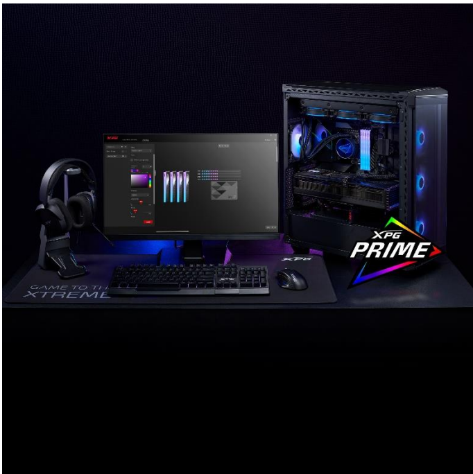
Unleash the Power of Synchronized Lighting Effects