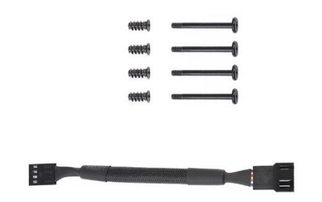
LNC Cable & Parts (M3 for Radiator x 4, T5x10 fan screw x 4)