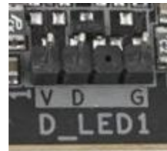
Digital Pin Header