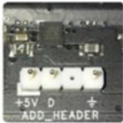
Aura Addressable Header